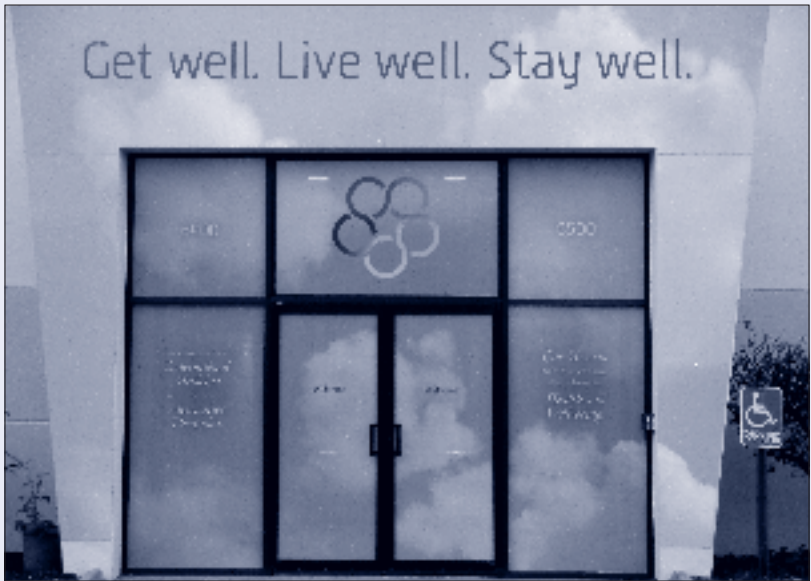
The Alliance Institute for Integrative Medicine