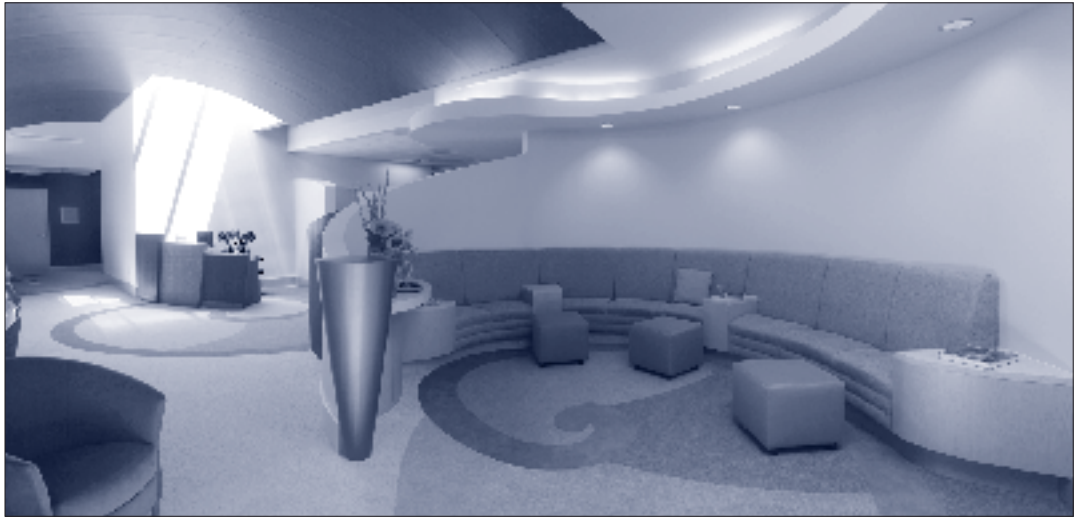
Scripps Center for Integrative Medicine

faculty pointed out, basic science research shows that the digestive system is controlled by the mind, and anxiety, depression, and fear affect its functioning. Social and psychological stress can aggravate a wide variety of diseases, such as diabetes mellitus, high blood pressure, and migraine headache. Emotions affect heart rate, blood pressure, sleep patterns, stomach acid secretion, and elimination processes. At the same time, clinical research has demonstrated health-promoting activities such as meditation, yoga, tai chi, exercise and social support systems have positive biological effects on the neuroendocrine and immune systems.