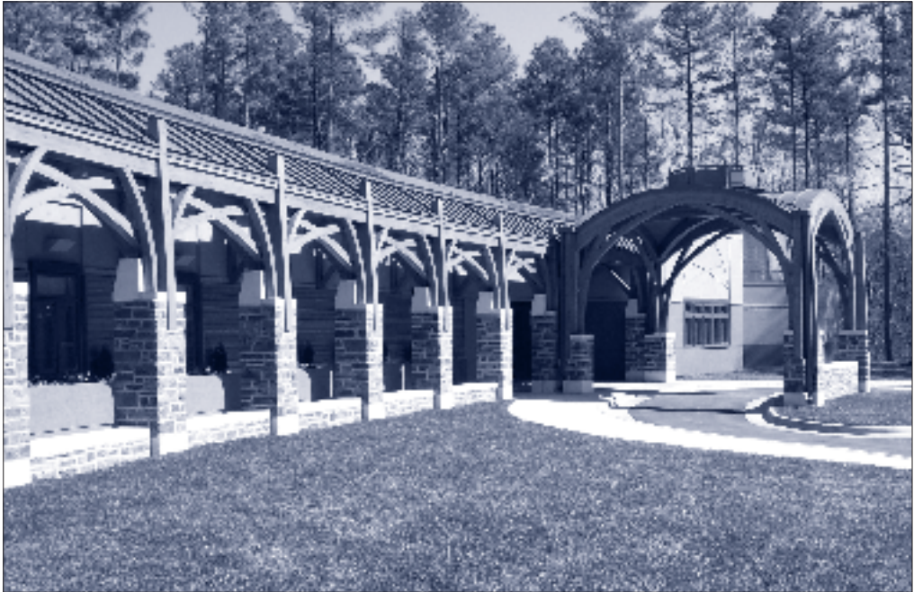
Duke Integrative Medicine

spiritual and relationship-centered life of the patient. “Equally, instead of creating a problems list, clinicians should create a health plan for the person based on the patient’s goals,” she said.